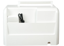
Hard cover with storage