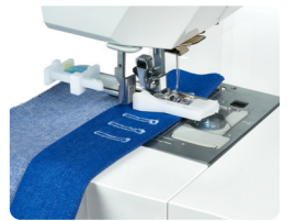
1-step buttonhole foot with variable cutting widths