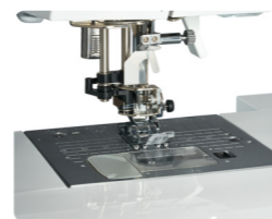
Fully automatic needle threader for fast and accurate threading