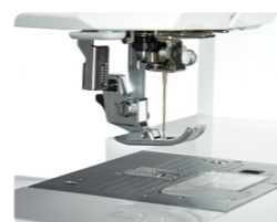
Extra high foot lift for thick fabrics