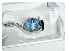
Advanced bobbin winder

Take your creations to the next level with our optional embroidery unit, featuring a generous 150mm by 200mm area for personal touches!